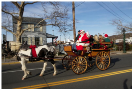
Santa Parade Santa, Chamber & Ferry