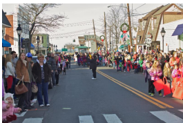
Santa Parade Main Street Crowds