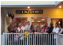
Port Jeff Liquors Ribbon Cutting