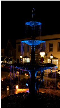
Blue Water Biddle Fountain