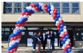
Health & Wellness Expo Balloon Arch with Committee Members