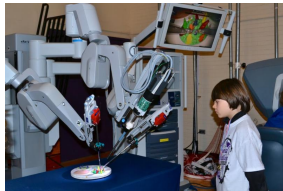
Stony Brook's DiVinci Machine