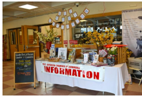
PJCC Info Table At Health & Wellness Expo