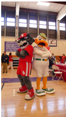
Wolfie & Quaker Posing

Mesita Mexican Restaurant 201 Main Street Port Jefferson, NY 11777 Fax: 717-659-5900 Email: info@mesitanmexican.com Website: www.mesitamexican.com