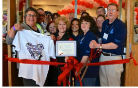
Ribbon Cutting for Health & Wellness Expo