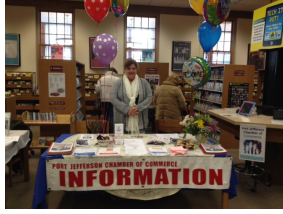
PJ Library Community Service Table