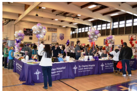
St. Charles Table