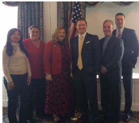
2014 New Directors w/ Mayor Garant