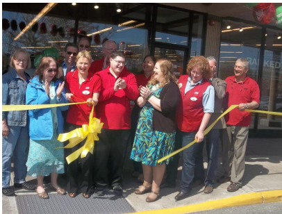
Ace's Hardware Ribbon Cutting Ceremony