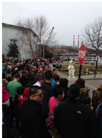
2013 Easter Parade Crowds waiting for Easter Hunt