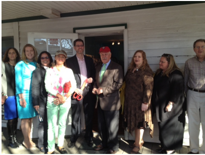
The Retreat Boutique Ribbon Cutting