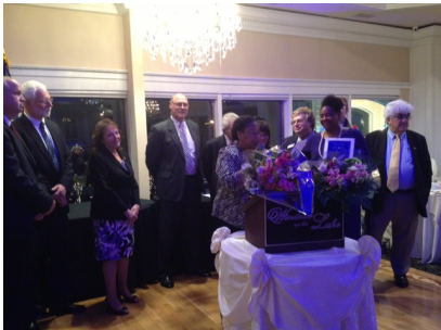
Nicole Christian Award