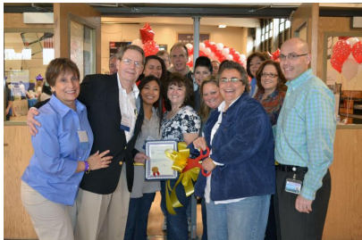
Health & Wellness Ribbon Cutting